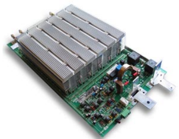
1 channel eload™ module of 0-5V, 100A, 18" x 10" x 3.5"

3-channel linear eload™ system of 0-12V, 20A/2A/0.2A current ranges. Add-ons to the systems are 1kHz AC impedance measurement, 4-channel auxiliary voltage, 4-channel auxiliary pressure, 4-channel auxiliary thermistor, 12V methanol measurement with 2 sensors and 24V CO 2 measurement with 1 sensor.